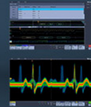
Protocol Analyser/Serial Decode & Trigger