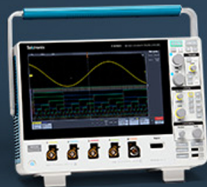
4 Channel 500MHz